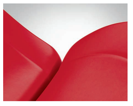
Premium climate upholstery Reduces heat buildup in the seat and back area and provides for more relaxation as a result of this cooling effect.