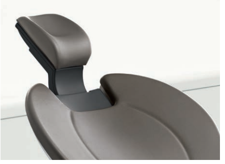
Premium Thermo upholstery

Reduces the accumulated heat in the seat and back area and provides for patient relaxation as a result of this cooling effect.