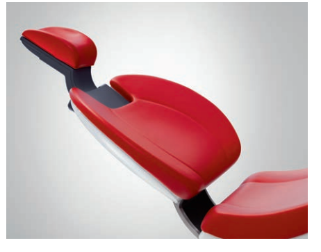
Lumbar support function The backrest can be adjusted individually to the shape of each patient's back.