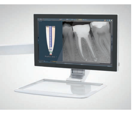
Multimedia consulting with 22" monitor X-rays, intraoral images, and planning views can be accessed easily from the EasyTouch user interface.