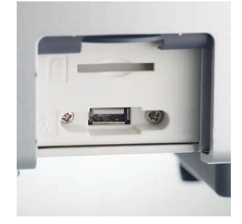
USB interface in the dentist element