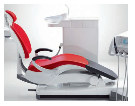
Maximum lowering range Sinius can be lowered to a height of 36 cm to make access easier for children and older patients.