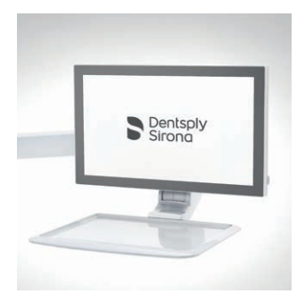
22" monitor on tray