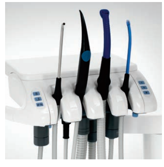
Surgical suction device