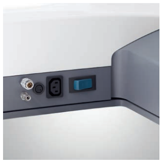
External device connection