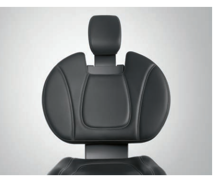
Lounge upholstery Soft, pleasant surface material and comfortable filling for the utmost relaxation. Contoured surface for perfect positioning.

With every aspect of comfort covered and the latest in multimedia technology, you and Sinius provide your patients with the best possible care. The extra comfort provided by Sinius pays off especially during prolonged treatment sessions. Your patients are relaxed throughout and you can concentrate on treating them. With the SiroCam AF/ AF+ and the 22" monitor you expand not only your own view as the medical professional but you also help your patients to understand and make more informed decisions about the treatment.