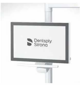
22" monitor on the light support frame