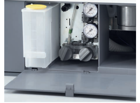
Automatic dosing If desired, the suction hose cleaning system can be equipped with automatic dispensing of chemicals from the Sirona maintenance and disinfectant list.