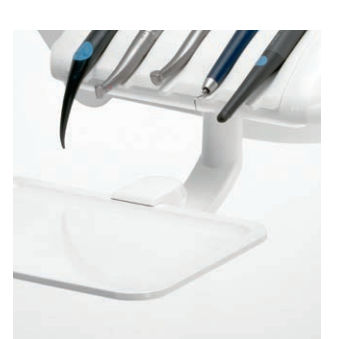
Swiveling tray holder (for Sinius CS)