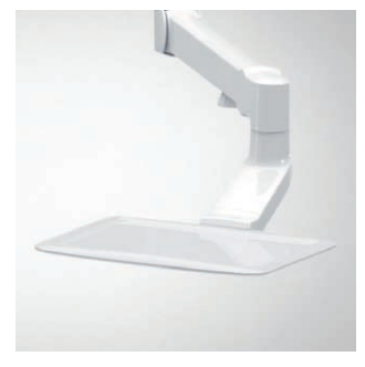
Dentsply Sirona tray (for Sinius)