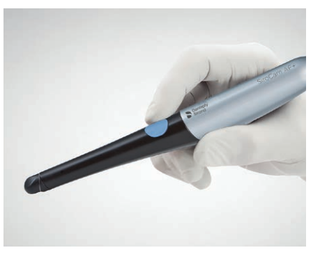
Ultramodern equipment The SiroCam AF/AF+ autofocus camera combines superior image quality with easy operation.